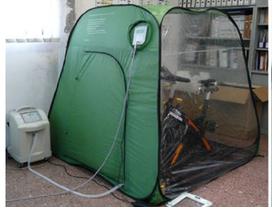
Fig. 1 Normobaric intermittent hypoxic tent equipped for research [143] and used to trained climbers for an Everest expedition, 2011 (unpublished results)

High-intensity exercise and intermittent hypoxia in the short and long term may have important medical applications in pathophysiological problems with metabolic-muscular disorders, such as obesity. However, nowadays, there are few studies and clinical initiatives to use stimuli of intense physical activity or intermittent hypoxia, with the uncertainty that patients may not bear this type of training or that the training may not result very pleasant for them. Although it is not possible to stay at high altitude and to remain